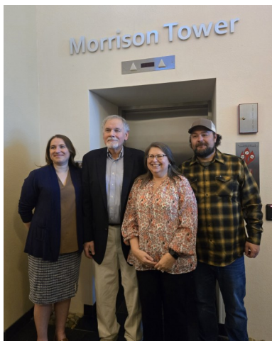
The Morrison Tower