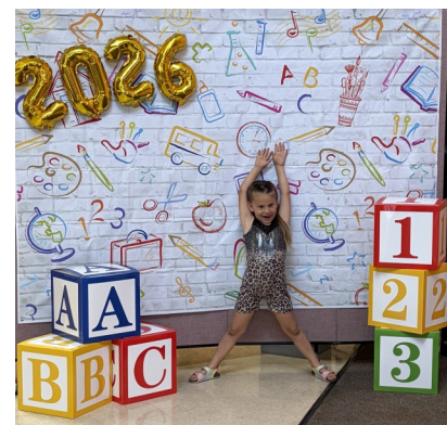
More school on page 4