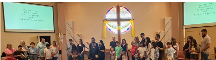
Families and Community celebrate fifth grade promotion at the last chapel of the school year.