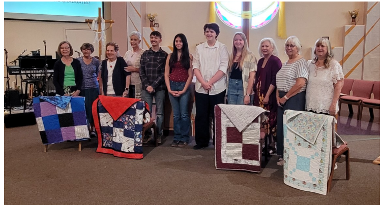
Graduation quilts and graduates pose with Banner Babes as they celebrate their recent accomplishments, and get ready for a new chapter in their lives.