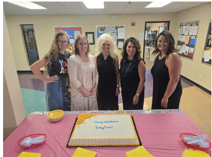
“Moving Up” celebration for our Preschool Students