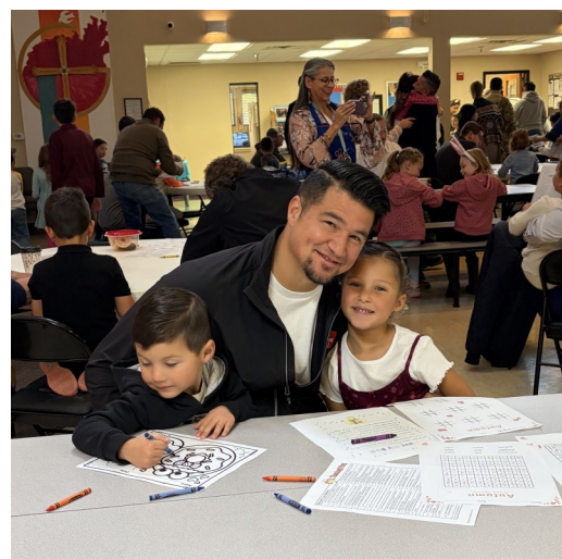
Dad is proud of these two!