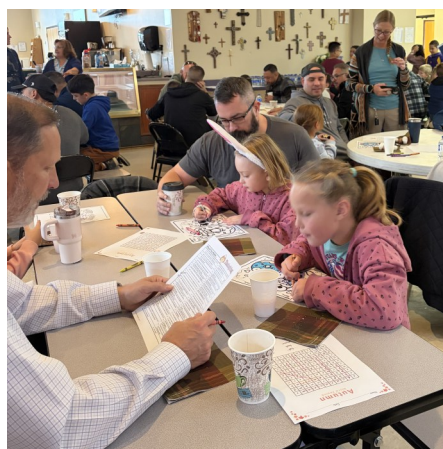
Sharing answers to table questions