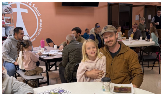
Special time with Dad