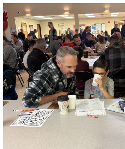
Wonderful lemonade and coffee