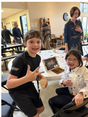
Sharing donuts with Dad via Facetime