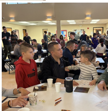
Dad is enjoying conversation and time with his boys.

Students will be on Winter Break December 22, 2025 thru January 5, 2026