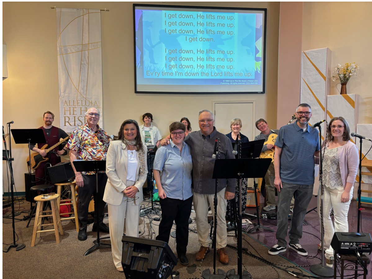
Our wonderful and talented Praise+ Team on Easter Sunday. Alleluia! Christ is risen!