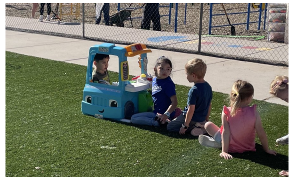
Waiting in the Taco Truck Line for taco orders.