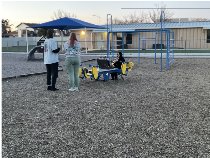
Serenading the Gaga players (left)