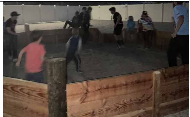
Gaga after dinner and Bible study (above)