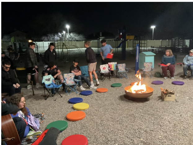
Ending the night around the campfire with music, worship, and smores (above and right)