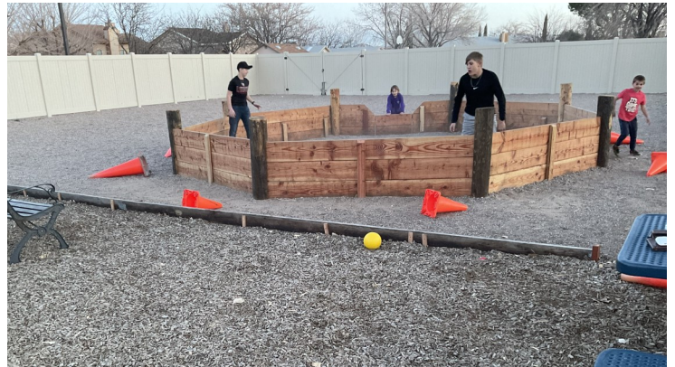
Gaga before dinner (above)