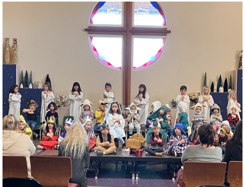
Preschool Christmas Program

Please click on the link below to learn more about our school. Enrollment for the 2024-2025 school year will open at the beginning of March 2024