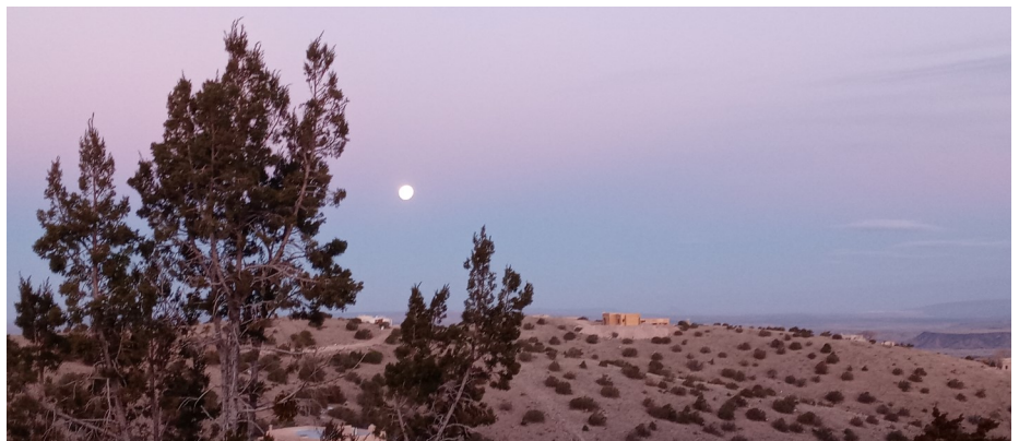
2022 February