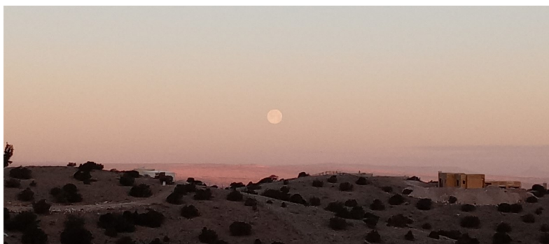
2022 February photo of the moon

There are so many little things you can do in this world to make it a better place. Always remember that you have a helper on your journey. The Lord is always with you, spring, summer, fall or winter.