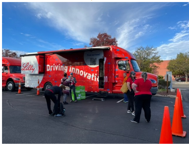
A Mobile Research Unit for Clinical Trial for Alzheimer’s Prevention parked in the COH parking lot on October 15. This was in conjunction with the Walk to End