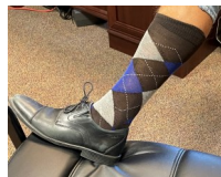
Argyle Socks! One of many great gifts.