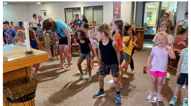
Above: Singing and dancing to the “Hippopotamus Song”.

“The most fun thing I did was paint a rock. I put a cross on it. It is red, black, blue, and green. When I see it, I will remember here. We sang “Step by Step.”