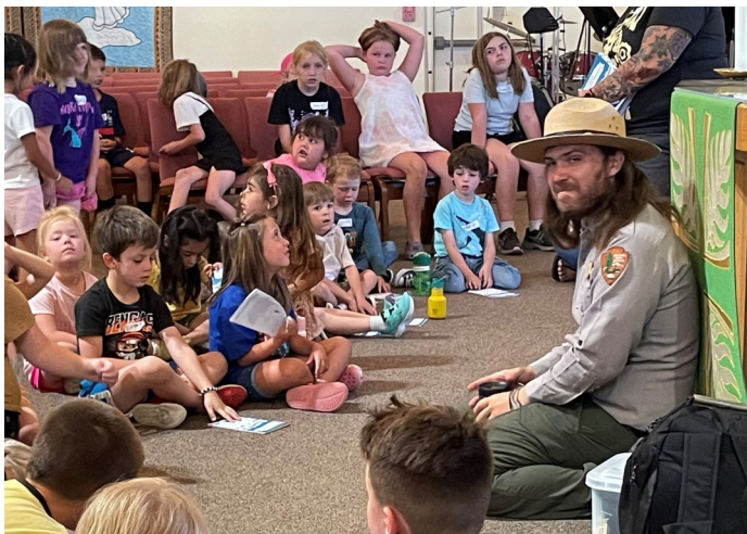
Listening and looking at fossils with the Forest Ranger