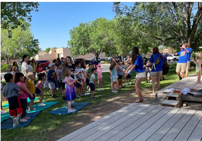
Dancing and Singing, animals, and more!