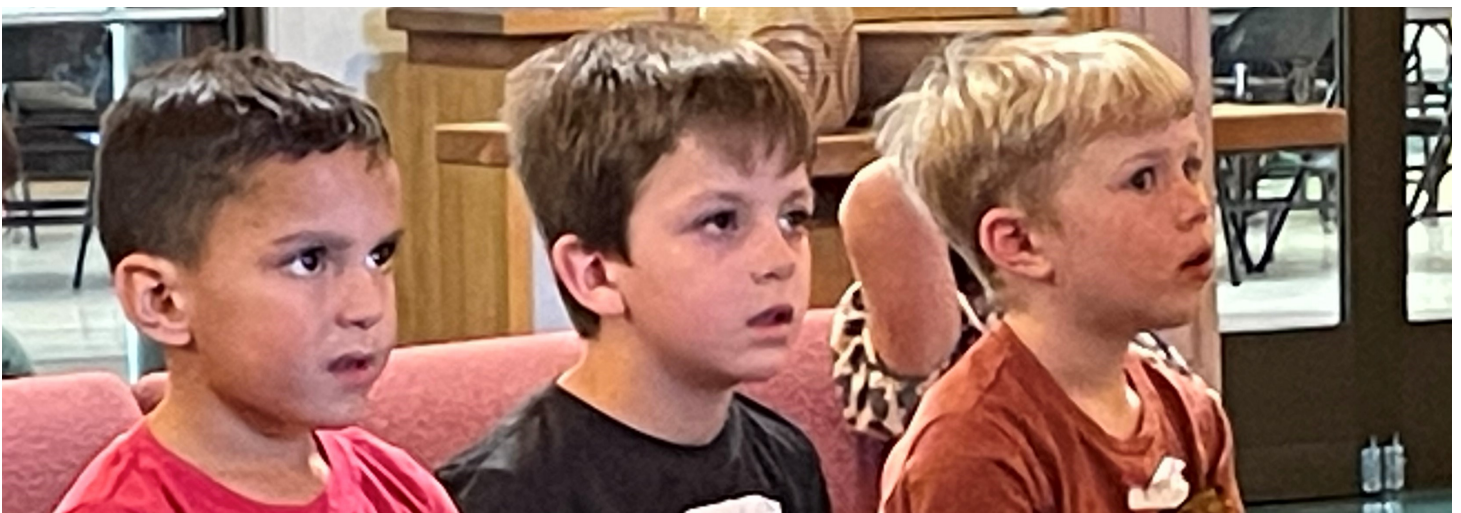
RTLCC campers intently listening to camp counselors about God's word and his message of "It's all about Grace".