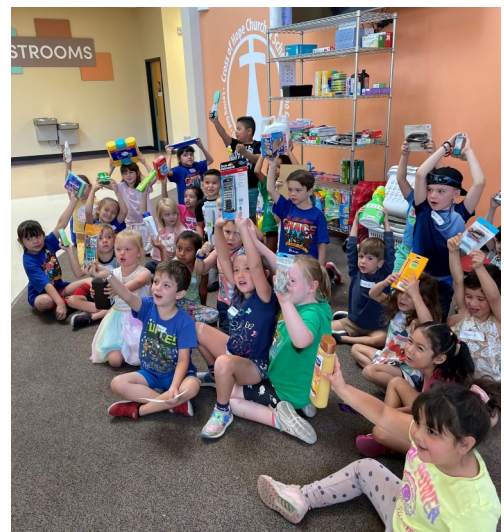
Donations for Saranam