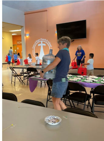
Keeping the campers hydrated!