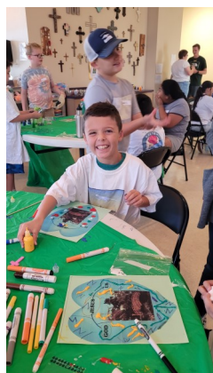
Rainbow Trail Day Camp crafts, games and Bible lesson.