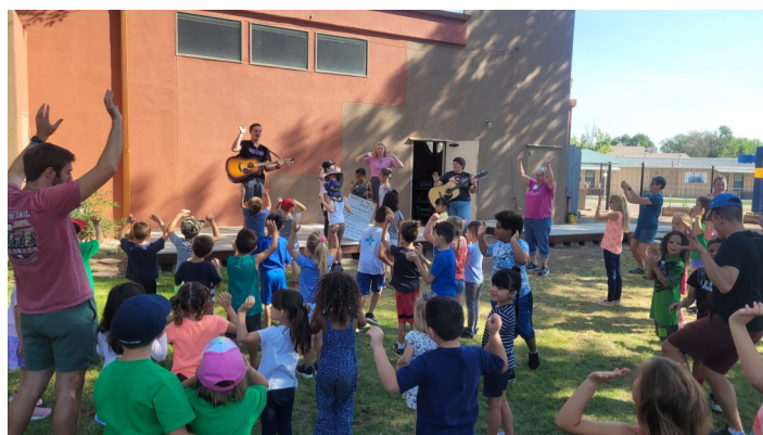
Rainbow Trail Day Camp outdoor worship

Let Me Be a Woman: Notes to My Daughter on the Meaning of Womanhood is a 1976 book by Elisabeth Elliott