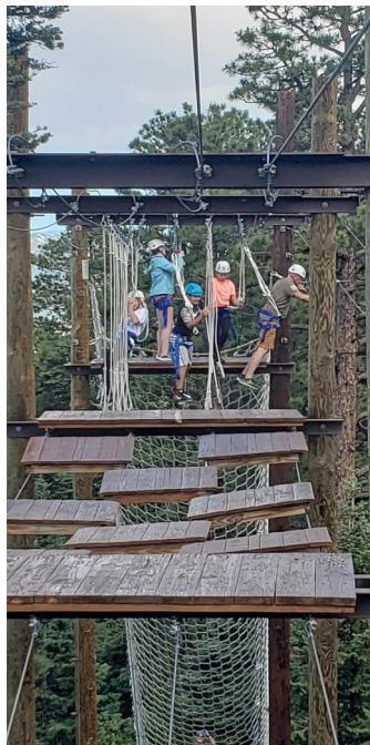
Confirmation Camp at Rainbow Trail Lutheran Camp