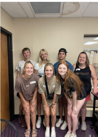
Youth Group from Calvary Lutheran Church