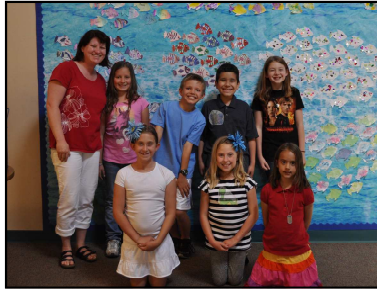
Spanish Poetry Contestants

We are very proud of all those students who participated in the Lutheran Schools Spelling Bee and the National Hispanic City-Wide Poetry Contest!